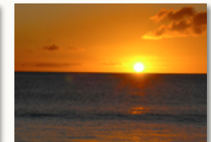
End of a beautiful tropical day!