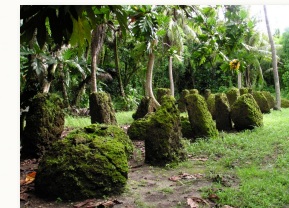
Respect of the cultural history is an important value in our work.