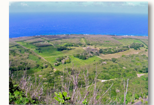
Pastoral operation in Saipan.