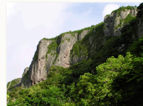
Focus on appropriate technologies for tropical ecosystems.