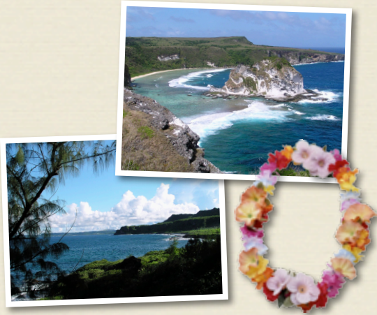
The beauty of the Marianas Islands

The goal of the three-year project is to work in partnership with local farmers, ranchers, technical resource personnel and other interagency collaborators to deploy extension outreach and assistance in grazing and livestock management practices and pasture improvement techniques. In addition, provide assistance and guidance in planning and development of special local needs projects to further benefit the economic viability of graziers in the Marianas.